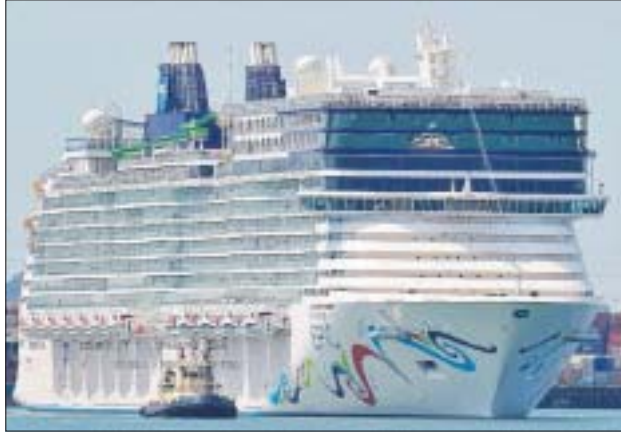
Floating resort: Norwegian Epic arrives in Southampton