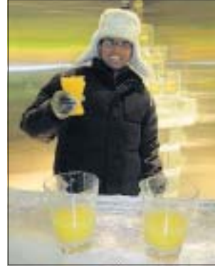
Ice breaker: The frozen bar

Even her greatest friends would not call the exterior beautiful – she looks top heavy, as if someone's carried out an ill-fitting loft extension – but inside the 19 decks boast elegant restaurants, an atmospheric jazz club, an intimate comedy venue, a circus 'tent'