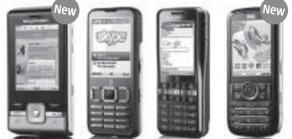
Sony Ericsson T715