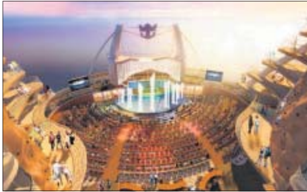
Aqua Theatre: The largest freshwater pool at sea – 5.4m (18ft) deep – will host everything from scuba lessons to synchronised swimming. Nozzles will shoot water 20m (65ft) high in time to music and lights