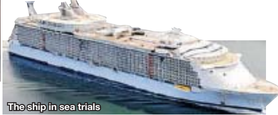
The ship in sea trials