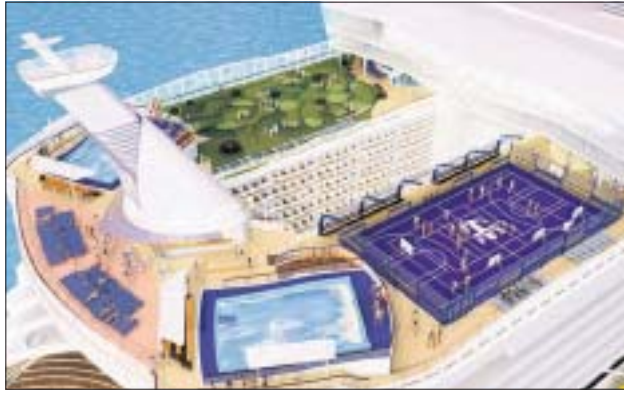
Sports court: Two surf machines, volleyball and basketball court, a miniature golf course and even a 25m (82ft) zipline nine decks above the Boardwalk. There are also two 13m (43ft) high climbing walls